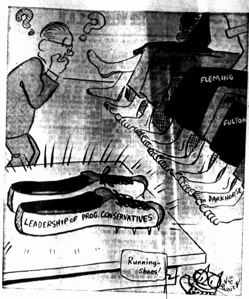
NOW TO LOOK OVER THE FEET

Mr. St. Laurent is quoted as saying "the Suez crisis and the trouble between Israel and the Arab nations are two different things". No one will dispute that. At the same time, it would be unrealistic to suggest that there is no relationship between them. Both are potential causes of large scale war in the Middle East; and no one seriously believes that if Colonel Nasser is permitted to have his way over the Suez he will, on that account, behave peaceably towards Israel.