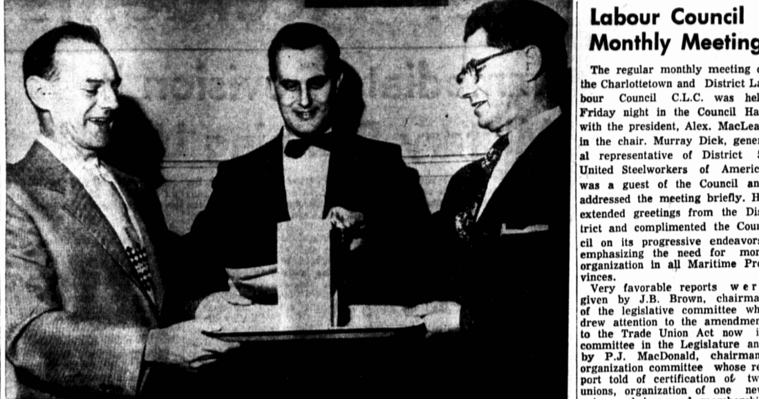
THE SATISFACTION of a job well done by the Knights of Columbus is registered on the faces of these members of the Charlottetown Knights of Columbus. They are shown "Burning the Mortgage" on the Knights of Columbus Home on Water Street in a ceremony in the Holy Name Hall on Saturday night.