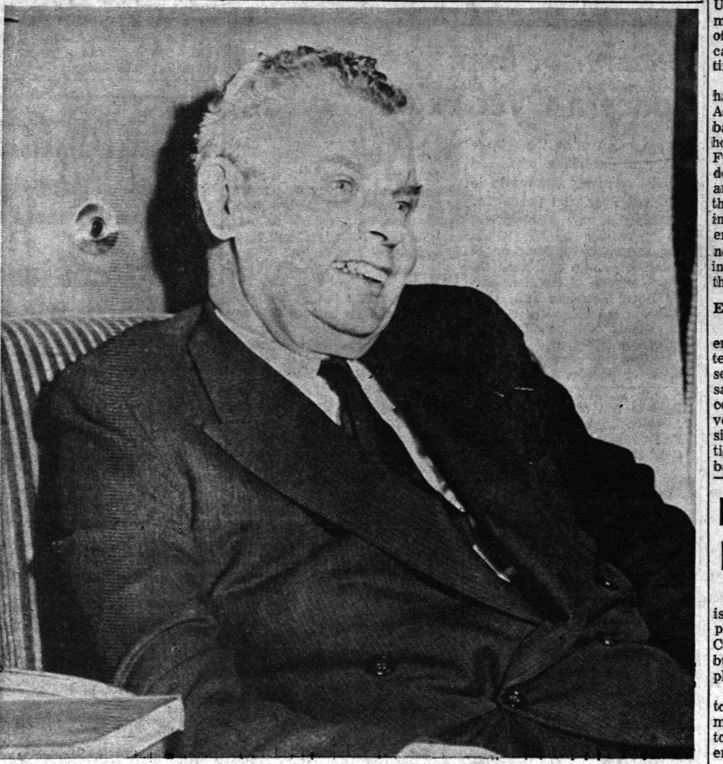
HAPPY BIRTHDAY DEAR JOHN

MONTREAL (CP) — Nine hundred Montreal welfare workers chanted "happy birthday dear John" when Prime Minister Diefenbaker spoke to them briefly about the Red Feather volunteer drive in Montreal. The Prime Minister was 83 Thursday.