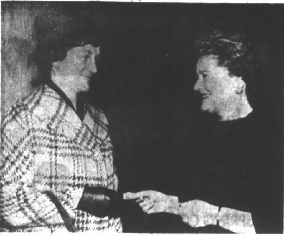
WE'LL LIKELY NEED MORE!