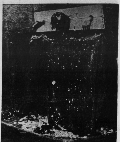
EGGHEAD TARGET service club to give children recreational facilities. Money collected is used by a