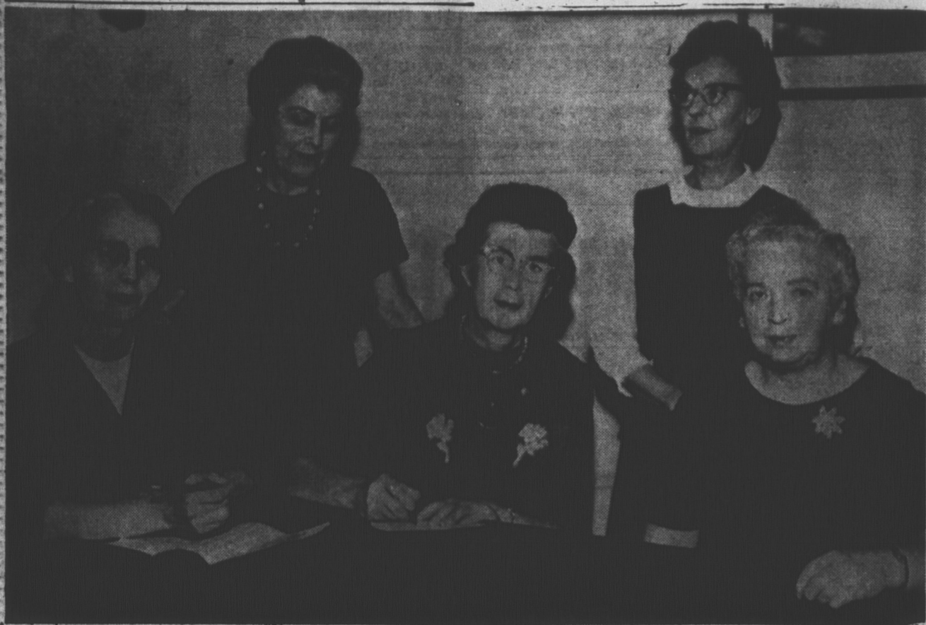
MUCH has been accomplished by B and P Clubs in Canada toward improving the status of women. Many and varied are their interests. SEATED ABOVE, FROM THE LEFT, are Flor-