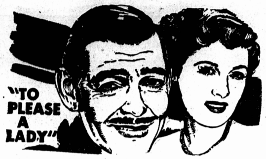
Clark Gable and Barbara Stanwyck, two of the screen's most popular personalities, co-star for the first time in 'To Please a Lady', next attraction at the Prince Edward Theatre. The new M-G-M hit of Miss Stanwyck cast as the girl who puts up a hopeless fight to elude him.

The roaring excitement of mid-get auto-racing and daredevil stunts in an auto thrill circus, climaxed by the 500-mile classic race of the regular-sized speedsters at Indianapolis, furnishes the background for 'To Please a Lady', which brings Clark Gable and Barbara Stanwyck to the Prince Edward screen starting Monday.