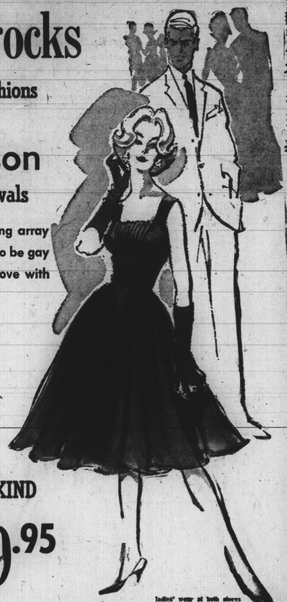
Ladies' wear at both stores

Moore & McLeod Ltd. Christmas Enchantment by Elizabeth Arden