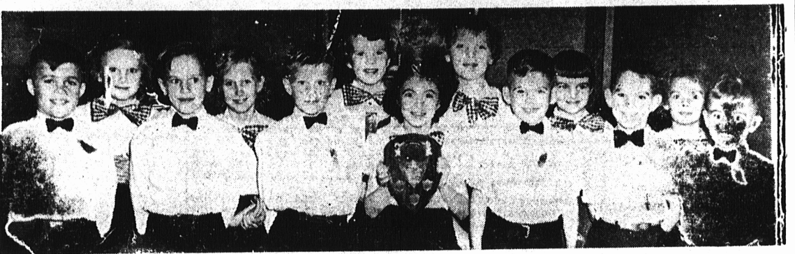
Neatly dressed in white shirts and blouses, and with natty bow ties, Grade 4A from the A/M Johnson School at R.C.A.F. Station Summerside are seen with their trophy after winning 1st place in Choral Speaking in Class 47, at the South Shore Music Festival in Summerside on Friday evening. This group combined for a very fine telling of the tale about "the gingham dog and the calico cat."