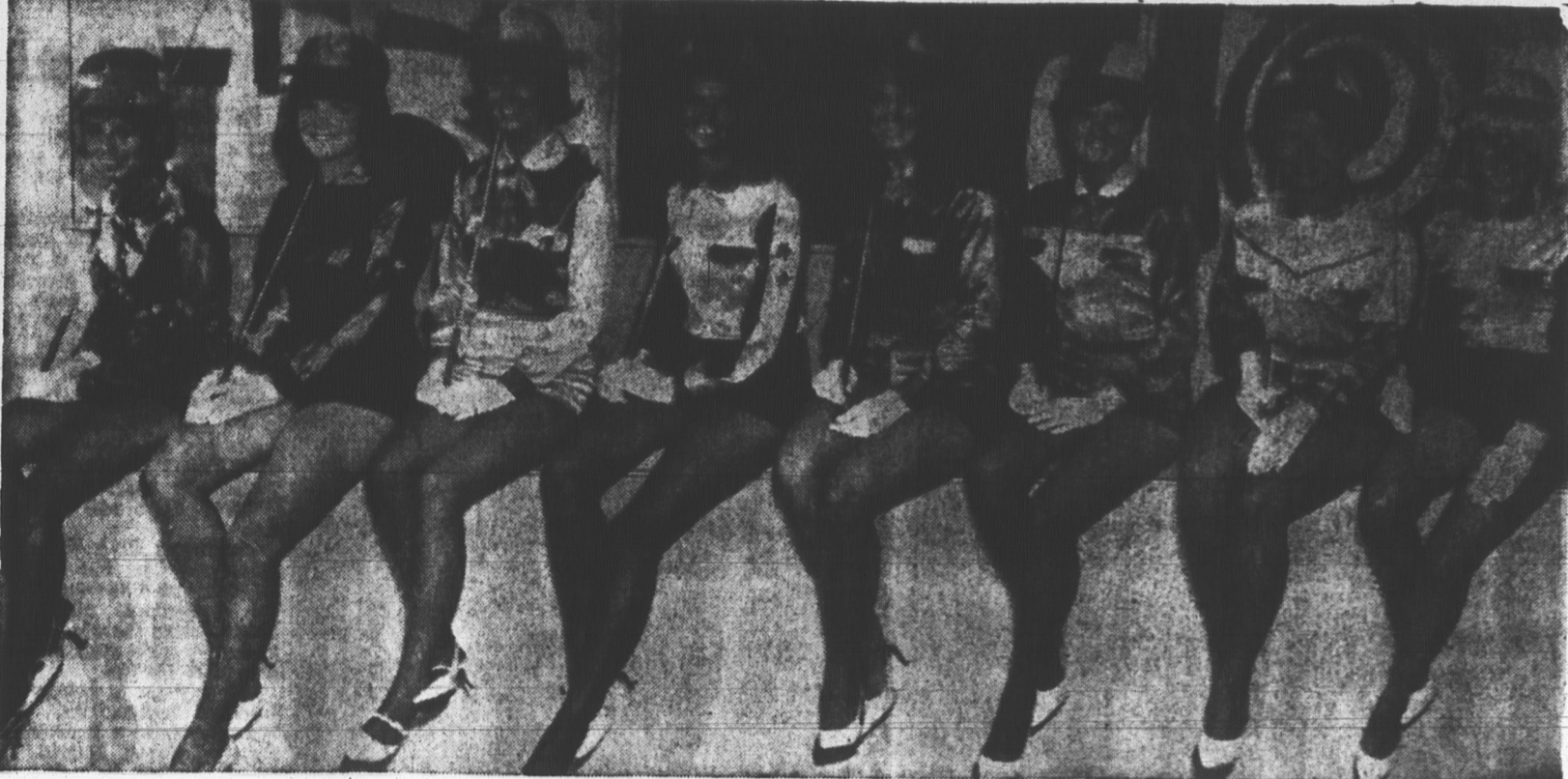
ISLAND BEAUTIES NO BACK-SEAT DRIVERS