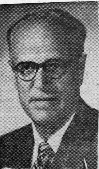
T. B. SPEAKER

MOSCOW (AP)—The Moiseyev folk dancers left by plane for the United States Wednesday to open a three-week stand at New York's Metropolitan Opera House. Then they will tour the United States and Canada.