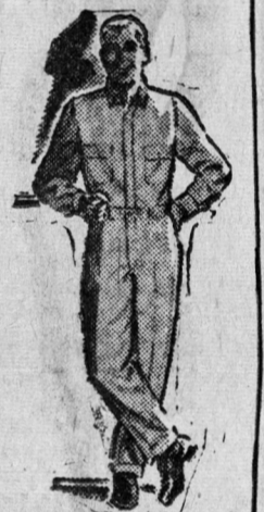
MEN'S WEAR—both stores