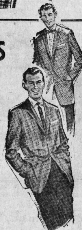
MEN'S WEAR—both stores