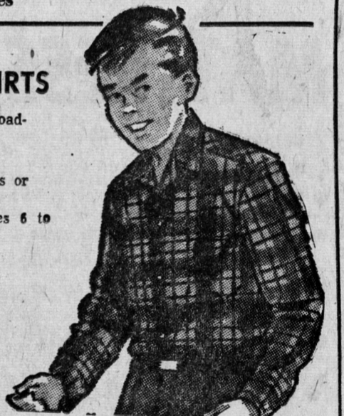
BOY'S WEAR—both stores