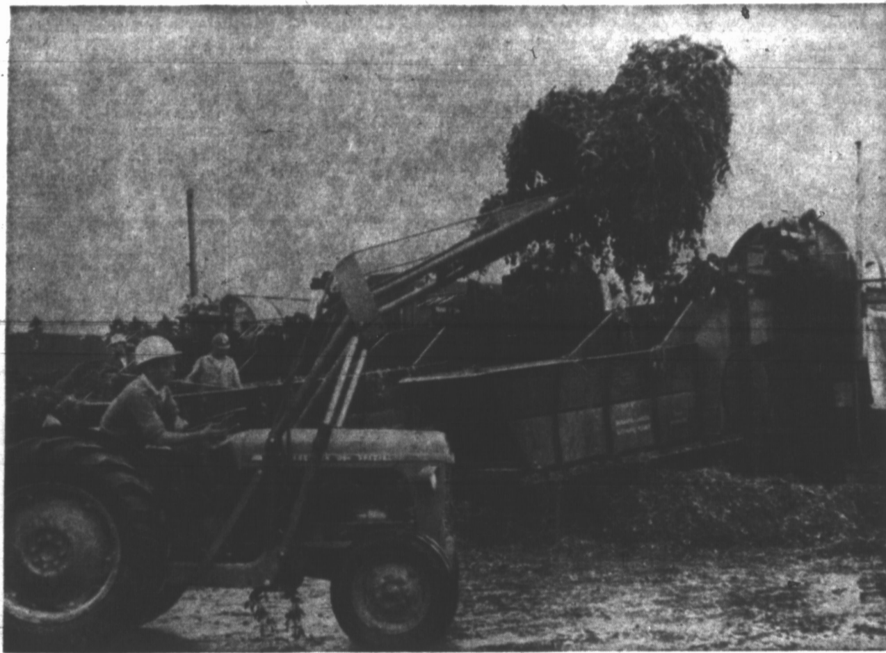
THRESHING PEAS AT LANKLEY PLANT