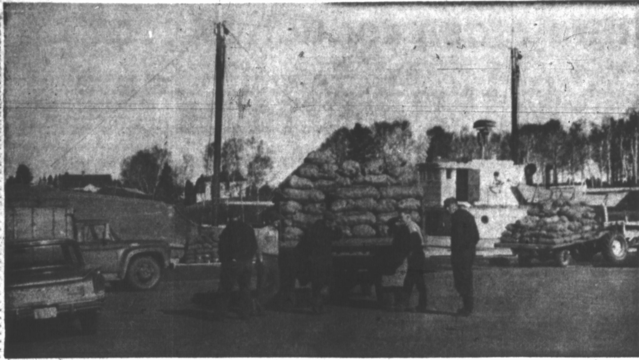
SPUDS MOVE BY SEA FROM MONTAGUE