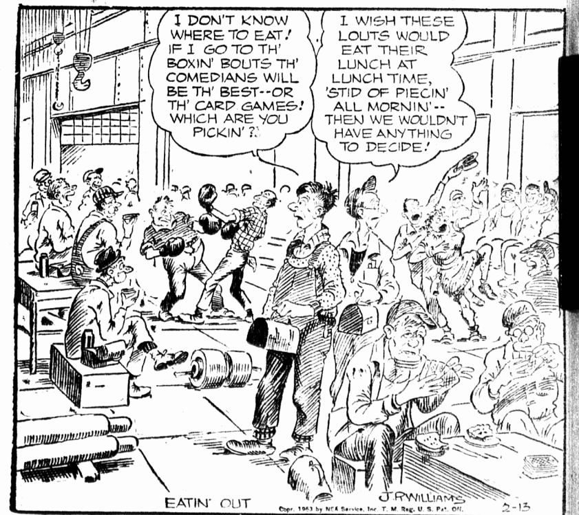
There Ought To Be A Law