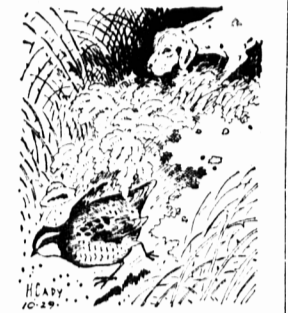
So Rob ran a little way, all the time keeping under cover.

It was the hunting season. On the very first day one of Bob White's big family had been shot, but not killed. He had been unlucky, yet at the same time he had been lucky. Sometimes things happen that way. He had been unlucky to be hit, but he had been lucky not to be more badly hurt than he was. In fact in so far as pain went he was not hurt at all. Shot had cut away some feathers, from one wing, but otherwise had not touched him. However, those lost feathers were the flight feathers, and without them he could not fly.