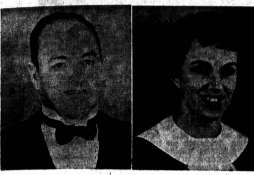
4th Year Medalists, P.W.C.