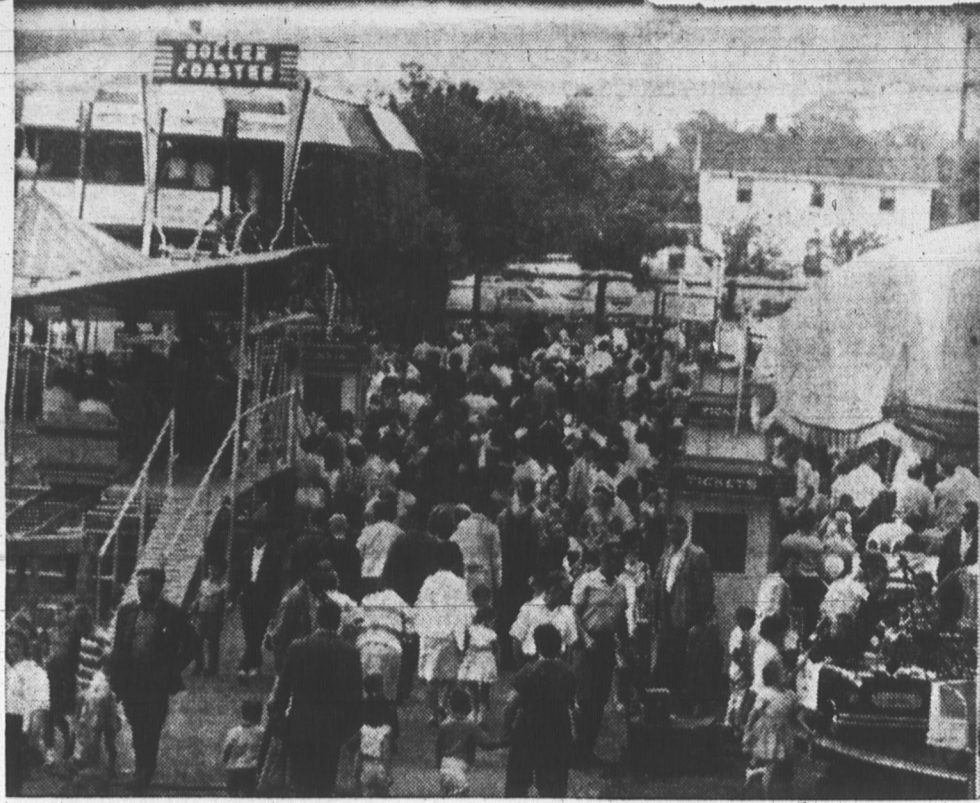
MIDWAY IS ATTRACTION FOR THOUSANDS