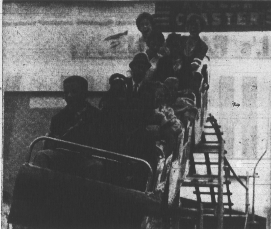
YOUNG AND OLD ENJOY THE RIDES

The good neighborhoods that permeates the exhibition and Old Home Week spills over into the business booths in the pavilion and surrounding grounds. Here rural and urban folk can receive the latest information on mechanized farming to the most recent in government plans concerning conservation and reforestation.