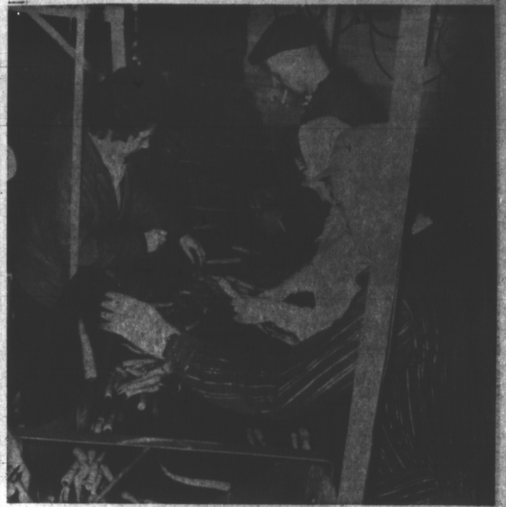
GRADING CARROTS IN O'LEARY PLANT