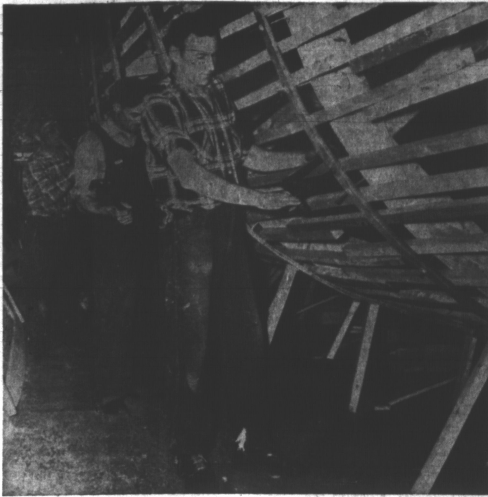
PREPARE HULL FOR PLANKING