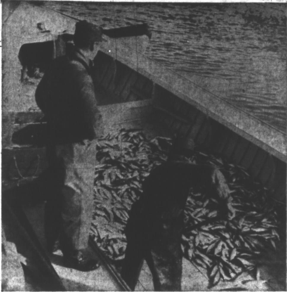
UNLOADING BAIT AT ALBERTON