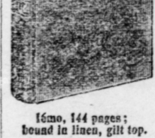
16mo, 144 pages; bound in linen, gilt top.