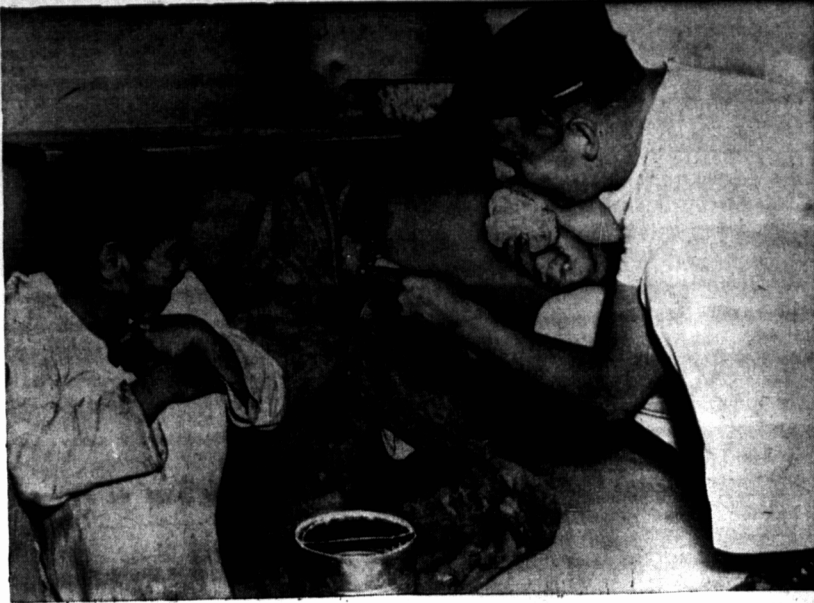
SOLDIER AND CHILD

In every country he has served the Canadian soldier has won a reputation for his sympathetic interest in children. And the trouble of Middle East is no exception, despite language difficulties.