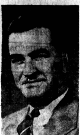
MR. MACLEAN energy plant at Deep River. Later in the month he will attend a convention of Leeds county to be held at Athens, Ont., also about 100 miles from the capital.

OTTAWA (Special) —In his position of deputy whip of the Conservative Party in the Commons, J. Angus MacLean, M.P., for Queens is being called upon these days to attend party nominating conventions in ridings in the Ottawa district and speak on behalf of the party and the Maritimes. This week Mr. MacLean was on the platform and spoke at the Conservative convention at Pembroke, Ont., 100 miles from Ottawa and a few miles from Canada's stormic