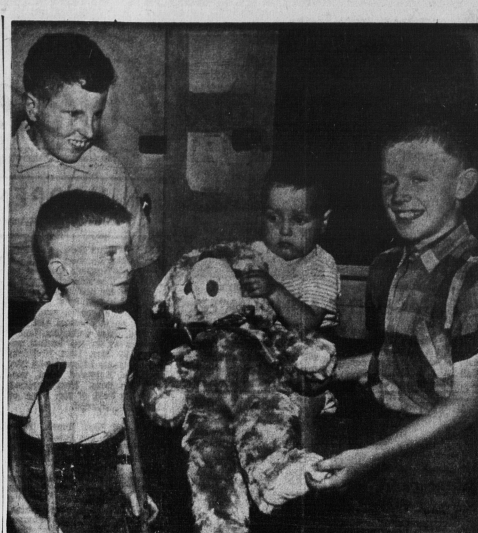
TEDDY BEAR PRESENTED REHAB PATIENTS Members of the South Platte School Junior Red Cross yesterday made a presentation to some of the younger patients under treatment at the