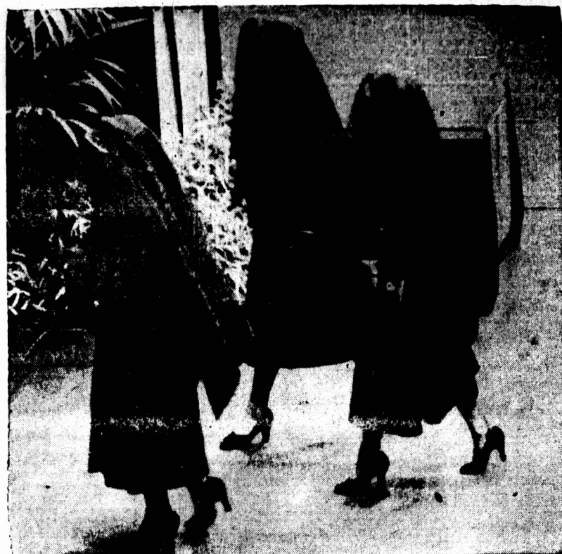
QUEEN MOTHER, QUEEN AND MARGARET