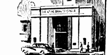
Goose Bay, Labrador. Here, at the famous airport, the Royal Bank opened a pioneer branch in a pioneer area during the war.