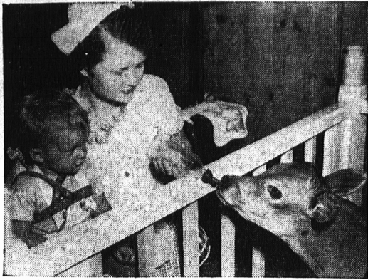
Beauregard's visitor decides he had better drink his milk and enjoy it and grow big like Beauregard.