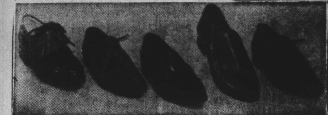
VERY FITTING gift! Want to give him shoes?—these will fit if you come close to the size. Very smart casuals too. Left to right: golf shoe in polished leather with removable kiltie; ultra lightweight, 3-eyelet tie in soft but rugged brushed leather; slip-on with the popular buckle-and-strap in the new square toe; new high chukka boot in polished grained leather; and a three-eyelet in grained leather with decorative side-stitching.