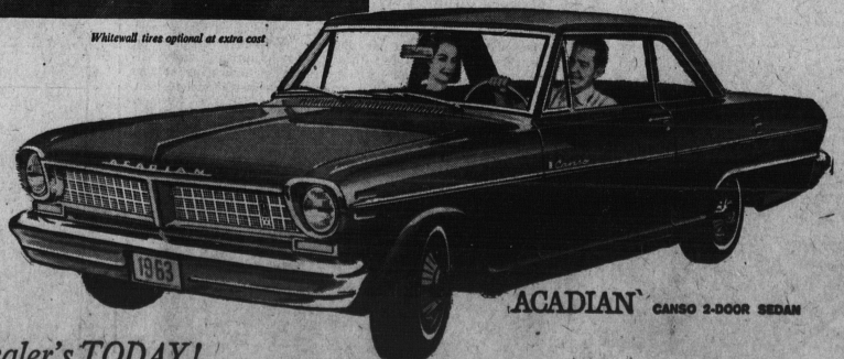
ACADIAN CANSO 2-DOOR SEDAN

Here's the 2-door Canso (it also comes in 4-door sedan). It's the newest addition to Acadian's success story. And it's where thrift and luxury are perfectly matched. This year also there are even sportier Beaumont Sport Deluxe models, a more elegantly appointed Beaumont series, and an economy-minded, family-size Invader Series in the line up.