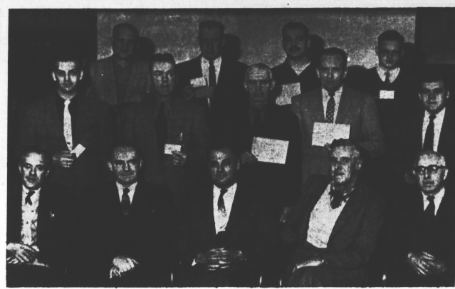
C. N. R. FIRST AID AWARDS