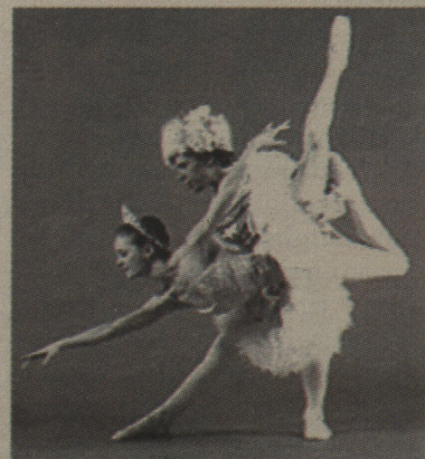
The Nutcracker at the Confederation Centre this Month.