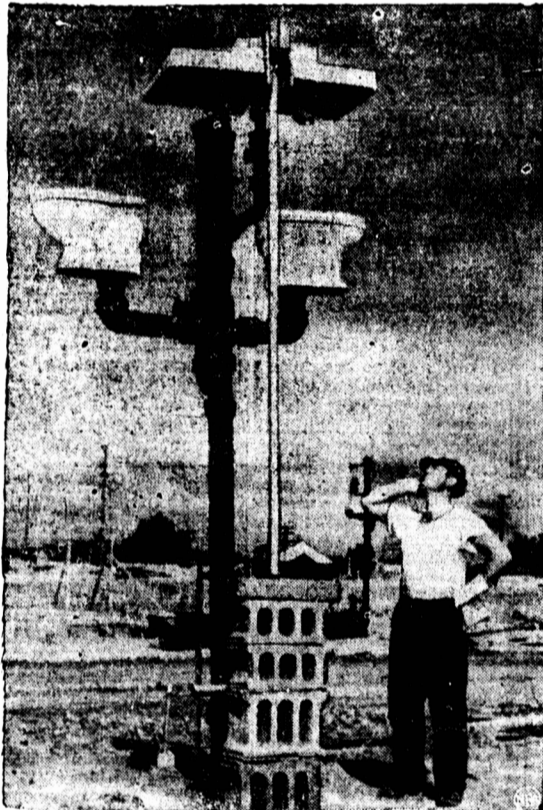
SEEMS PLUMB CRAZY—An unbelieving worker at site of a municipal housing development in St. Paul, Minn., stares at what appears to be outdoor indoor plumbing. Passersby at first thought it was something new in lampposts. Simple fact was that plumbers got ahead of carpenters and installed pipes and fixtures before the houses were up. There was some speculation on what would have happened if the roofers had gotten there first.