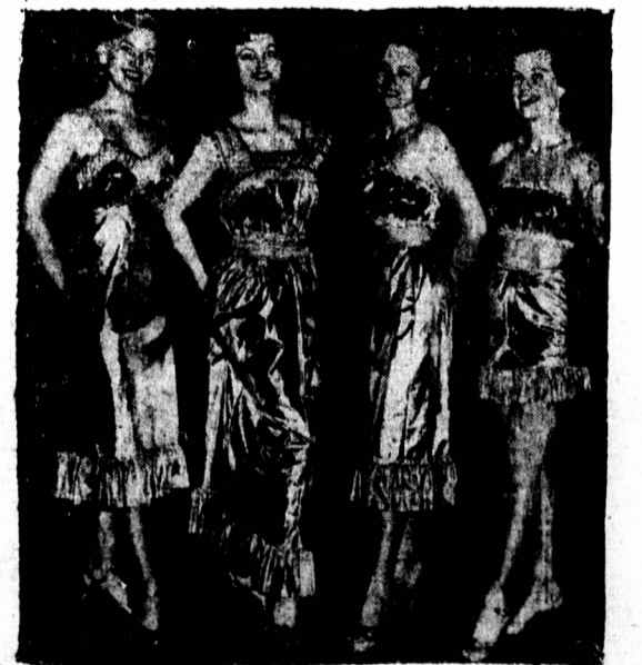
BABY, IT'S COLD OUTSIDE—Yessir, that's 24-karat gold lingerie these glitter-gals are wearing. The six-piece set, consisting of matching slip, nightgown, pettiskirt, panties and bras are made of nylon plated with gold leaf and is valued at $2000. It was displayed as a Chicago fashion show.