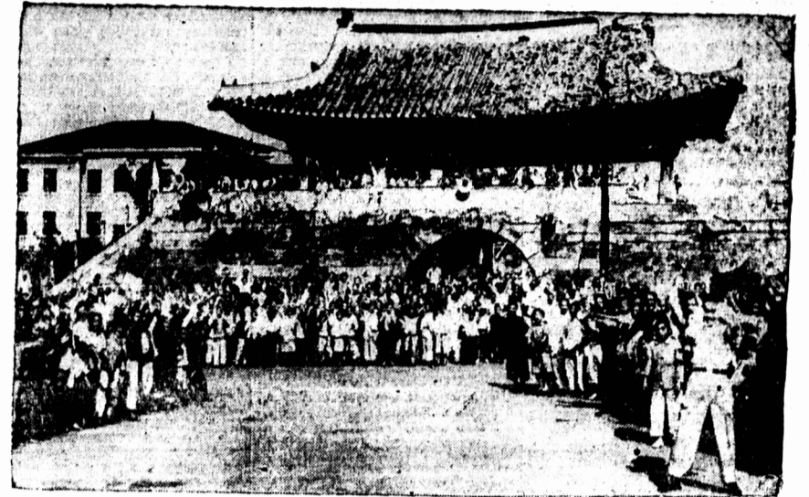
In October, 1950, nearly all of Kaesong turned out to cheer troops of the 1st Cavalry Division as they swept through, chasing the Reds over the 38th Parallel. But...