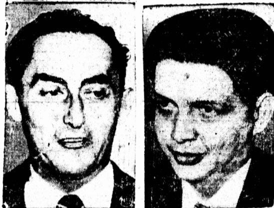
F.B.I. SEEKS FOUR REDS—The F.B.I.'s best manhunters are seeking the trail of the four Red leaders pictured above. Members of the 11-man top layer of the U.S. Communist Party, convicted of plotting to teach violent revolution against the Government, failed to show up in New York Federal Court for commitment to prison with their seven comrades. They are Henry Winston (top, left), national organization secretary; Gus Hall (top, right), Ohio party chairman; Gilbert Green (bottom, left), Illinois party chairman; and Robert G. Thompson, bottom, right), New York State party chairman.