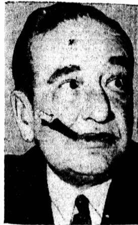
Maurice Petsche, seen above, independent politician and brilliant economist has accepted task from President Auriol of trying to form France's next government—the 15th since the end of the war. Last month's elections did not see any party returned with a big enough majority to form a single party administration. So 56-year-old out-going minister of finance hopes to form a middle-of-the-road coalition of Socialists, popular Republicans, Radicals and near Radicals and moderate Conservatives. Former Premier Henri Queuille declined position on grounds of ill health.