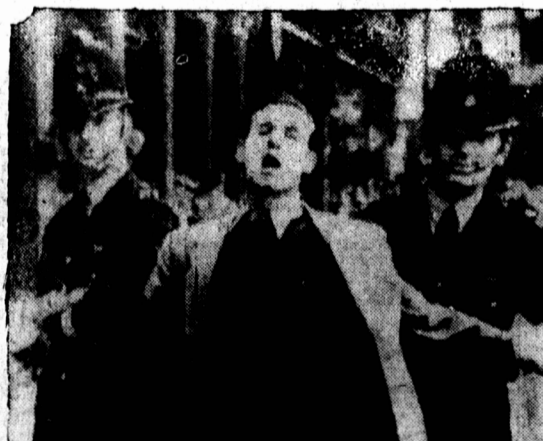
Police haul off a Communist demonstrator who tried to interrupt ceremonies in London honoring American Independence Day. The demonstrators failed to interfere with presentation to St. Paul's Cathedral by Gen. Eisenhower of a roll call listing the names of American servicemen who died in Britain during the last war.