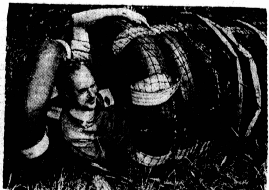
WILLIAM "RED" HILL IS SEEN WITH TIRES