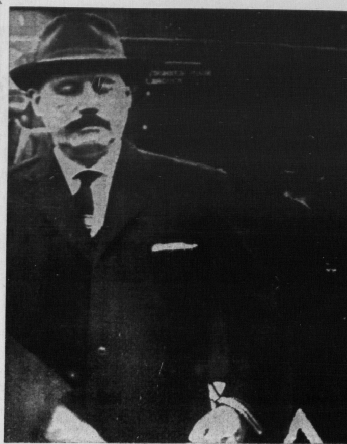
SALAN IN HANDCUFFS