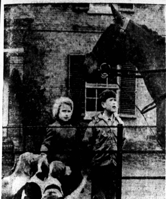
ATTEND FOX HUNT

Hounds and horses fascinate fox hunt at Sandringham. Eng. Prince Charles and Princess Anne went around patting the animals before the hunt started.