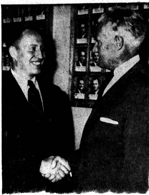
TAKES COURSE IN DETROIT