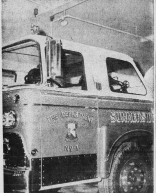
NEW TRUCK ADDS EFFICIENCY