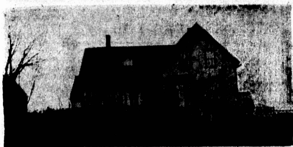
Before 1950 Competition