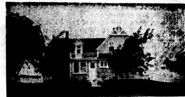
After 1950 Competition