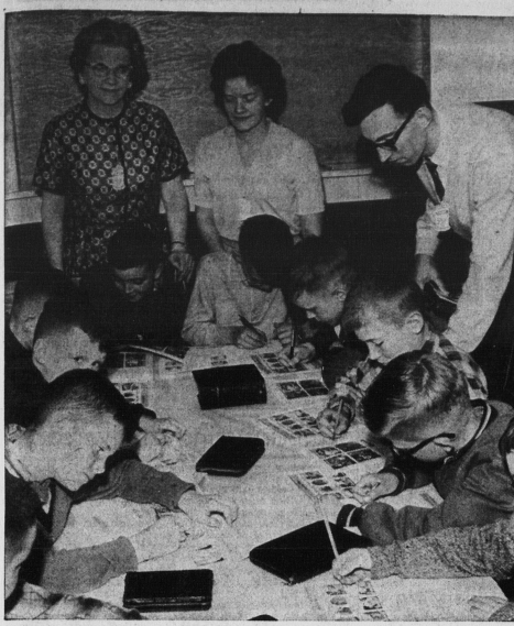
'THE JUNIOR boys' class is seen here with three supervisors at the Easter Vacation Bible School being conducted this week at Maritime Christian College. The schools are normally held during the summer vacation, but a number of churches are beginning to hold them during spring holidays too.