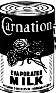
"From Contented Cows"

TO find the answer — "cream" your coffee with Carnation Evaporated Milk. Even the best cup of coffee tastes better with Carnation — richer flavored, smoother, more appetizing. Yet Carnation costs only about half as much as light cream. Try it. Discover why millions of critical coffee drinkers prefer Carnation to cream in coffee.