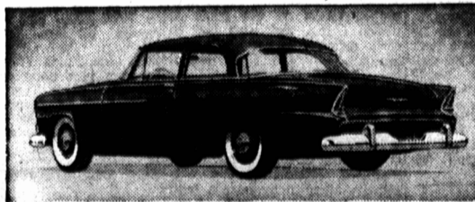
It's the longest of the low-priced three! From bumper to bumper it's 204 inches long—and that's actually as long as motorcars costing hundreds of dollars more! So why accept less? Get the size you want, the beauty you want in a low-cost Plymouth!

Plymouth's New Horizon swept-back windshield is the first to wrap fully around at top as well as at the bottom—to give you extra vision at eye level where you need it most! Best of all, Plymouth's flashing new Hy-Fire V-8 and the stepped-up PowerFlow Six engines, all give top performance on regular grade fuel! Get the whole exciting story firsthand. Visit your Chrysler-Plymouth-Fargo dealer now!