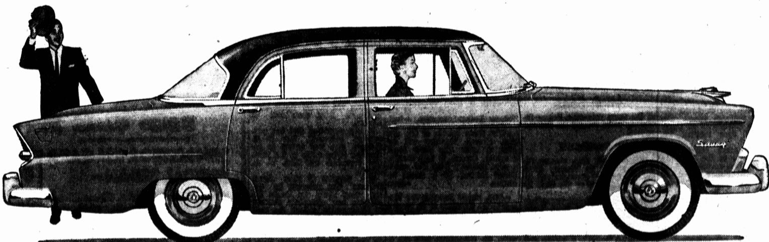
Manufactured in Canada by Chrysler Corporation of Canada, Limited

Compare for size... style... features! See why the big, beautiful PLYMOUTH is the Big Buy of all three!