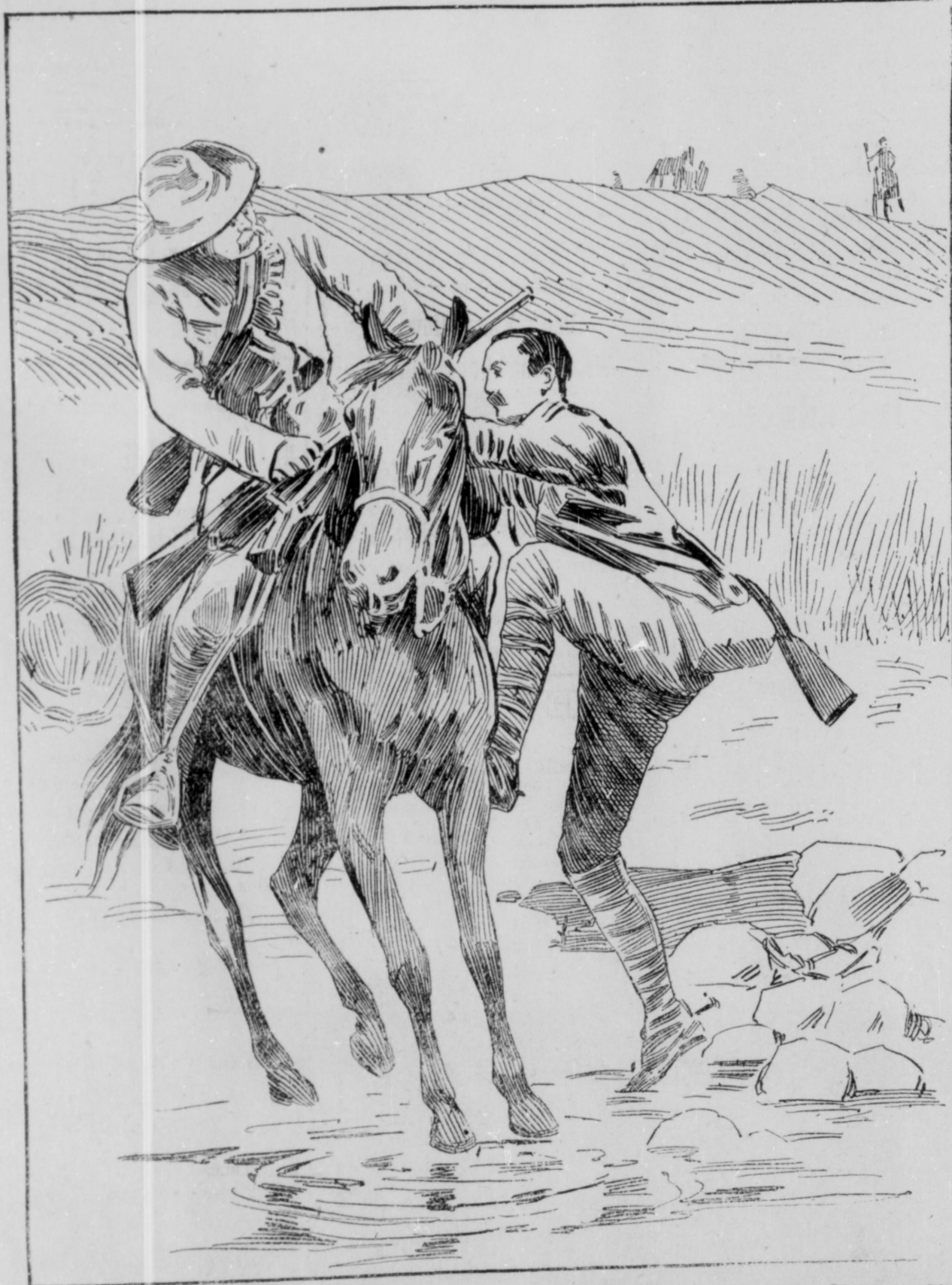
HOW THE VICTORIA CROSS IS WON—HELPING A COMRADE TO ESCAPE.