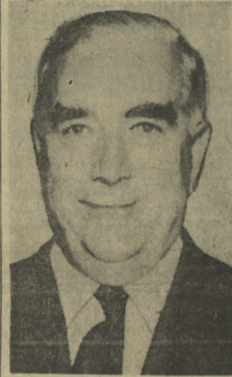
PRIME MINISTER MENZIES

CANBERRA, Australia (Reuters) — The coalition government of Prime Minister Robert Menzies, already assured of a decisive majority in the House of Representatives, appeared certain to wind up with control of the Senate as well.