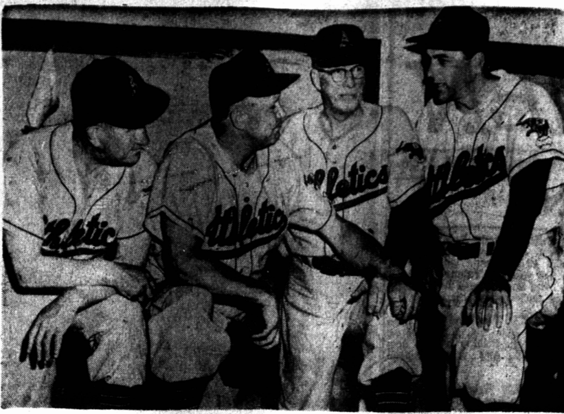
LOU CAN DREAM, CAN'T HE? "If I had these three, I'd be all right," sighs Lou Boudreau, right manager of the tail-end Kansas City Athletics, as he chats with a trio of baseball immortals, all former Athletics. They were in Kansas City for ceremonies in connection with the selection of a second member of the A's "Hall of Fame." The old-timers are, left to right: Mickey Cochrane, Jimmy Foxx and Bob "Lefty" Grove, who was named to the "Hall of Fame."