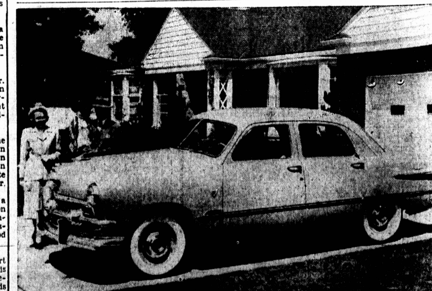
NEW FORD FOR 1951: There are more than 40 points of improvement in the new Ford passenger cars of 1951, which are now on display in this Province. Major styling and mechanical advancements are incorporated in the new models.