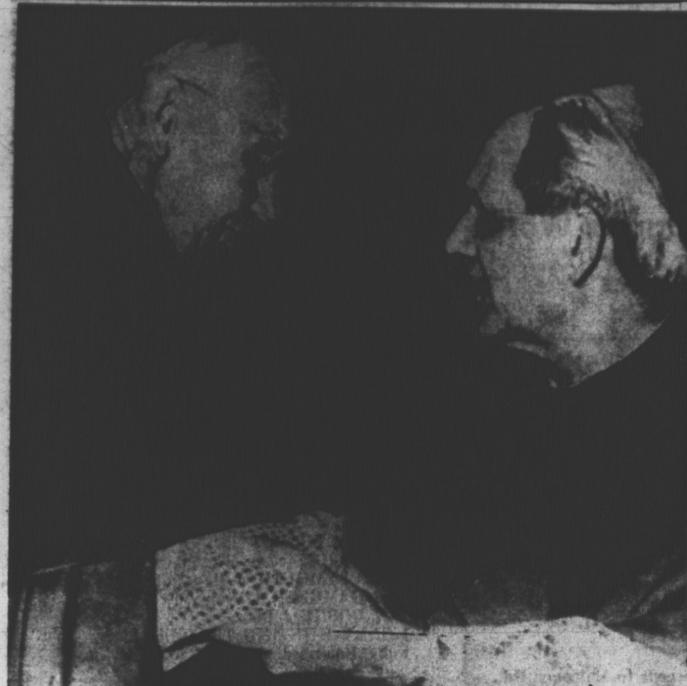
AUGUSTIN CARDINAL Bes, left, head of the Vatican Secretariat for Christian Unity, talks with Paul-Emile Cardinal Leger of Montreal before

opening Wednesday of the Ecumenical Council working session in St. Peter's Basilica. The Council completed piecemeal voting on its religious li-