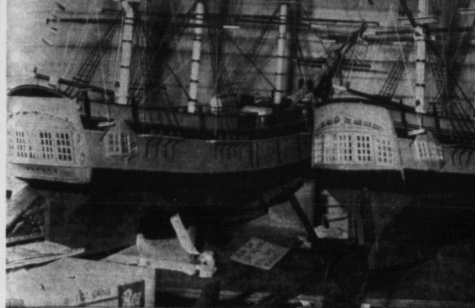
SCALE MODELS EXHIBITED AT S'SIDE

OTTAWA (CP)—A bond issue program to pay off a $255,000,000 bond debt maturing Aug. 1 was announced Monday by Finance Minister Fleming. It involves two new issues of long-term government bonds totaling $200,000,000 and sale of $55,000,000 in 365-day treasury bills. The long-term issues will be: 1. Seven-year, two-month 5 1/2 per cent, non-callable bonds due Oct. 1, 1970, at a price of 98 per cent to maturity. 2. 15-year 5 1/2 per cent non-callable bonds due Aug. 1, 1980, at a price of 98 per cent to maturity. The issues are available to investors immediately and the Bank of Canada already has agreed to acquire a minimum of $50,000,000 worth. Amounts of each issue will depend on demand. than textbooks, because they are capable of encouraging a student to think, rather than simply presenting and reviewing facts," Prof. Hall concluded.