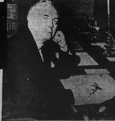
NEW PRIME MINISTER AT HIS DESK This is the first official picture of Prime Minister Harold Wilson of Great Britain in the cabinet room of his official residence at No. 10 Downing Street, London, Thursday. In foreground can be seen the "hot line"—direct telephone communication with Washington.