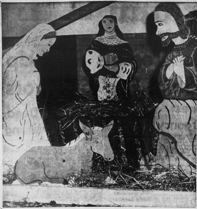
NATIVITY SCENE AT PARKDALE Motorsists traveling along St. Peter's Road in Parkdale have been admiring this nativity scene beside the St. Pius X church, Gardfield Lane. This scene shows only three of the several figures which comprise the manger scene. The entire display is about 13 feet long and five feet high. The plywood figures are hand painted and the entire scene is lighted for night viewing.