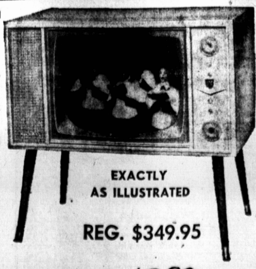
EXACTLY AS ILLUSTRATED