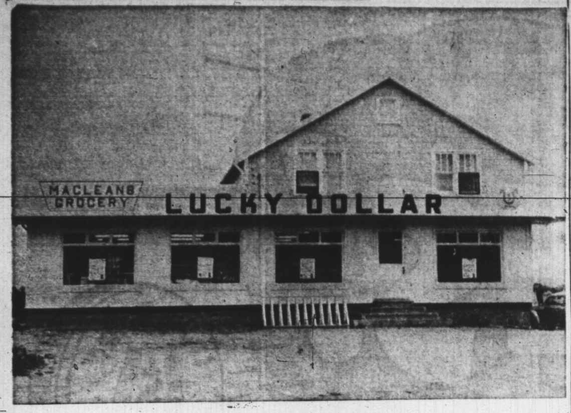
WINSLOE'S ENLARGED STORE