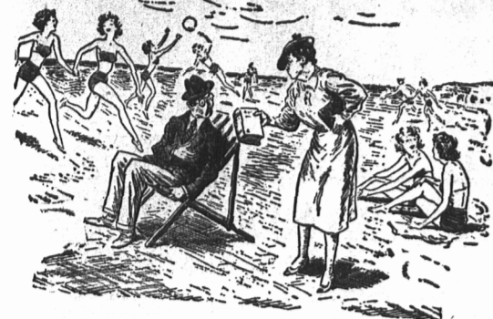
Here's the book I want you to read, and I shall question you on the whole of it when I come back. -Humorist.