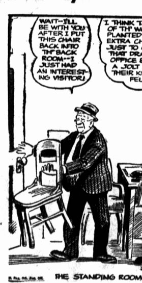
THE STANDING ROOM