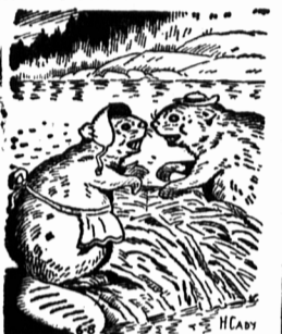
"A wise Beaver knows when to keep a closed mouth," replied Mrs. Paddy.

Yesterday's Cryptoquote: THAT EXECRABLE SUM OF ALL VILLAINIES COMMONLY CALLED A SLAVE TRADE —WESLEY.